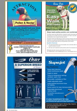
Samples of quarter page ads

For full details and visit our website www.petnews.com.au